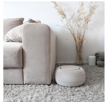
Fits the office, in a lounge or even home environment as well.