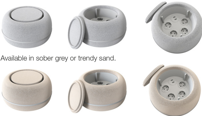
Available in sober grey or trendy sand.