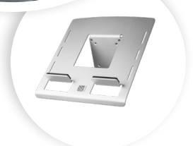
R-GO MORELIA LAPTOP HOLDER