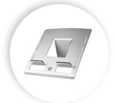
R-GO MORELIA LAPTOP HOLDER